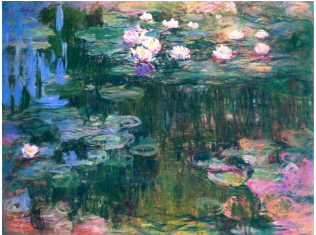
Monet: Water Lilies

ART SMART was developed by the PTA as a cultural enrichment program. It introduces kids to famous pieces of art in a low key, fun way by letting them observe, think and discuss famous paintings and artists from around the world.